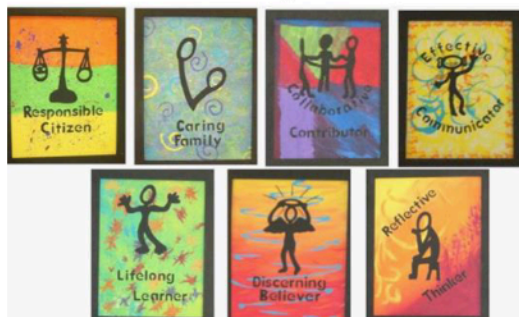
Catholic Graduate Expectations

Please review the following guidelines with your children to ensure we all come to school ready to learn, serve, love, and grow together: